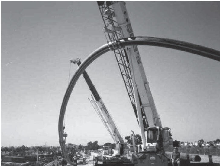
Figure 3 Butt Fused PE Pipe “Arched” for Insertion into Directional Drilling Installation