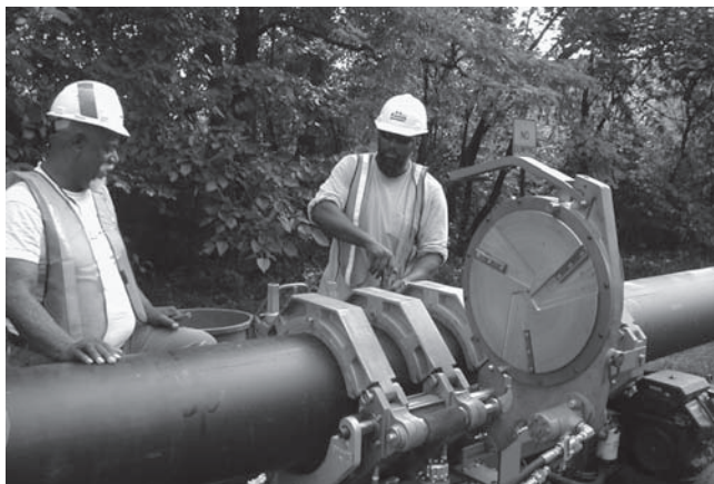
Figure 1 Joining Large Diameter PE Pipe with Butt Fusion

Since its discovery in 1933, PE has grown to become one of the world's most widely used and recognized thermoplastic materials.(1) The versatility of this unique plastic material is demonstrated by the diversity of its use and applications. The original application for PE was as a substitute for rubber in electrical insulation during World War II. PE has since become one of the world's most widely utilized thermoplastics. Today's modern PE resins are highly engineered for much more rigorous applications such as pressure-rated gas and water pipe, landfill membranes, automotive fuel tanks and other demanding applications.