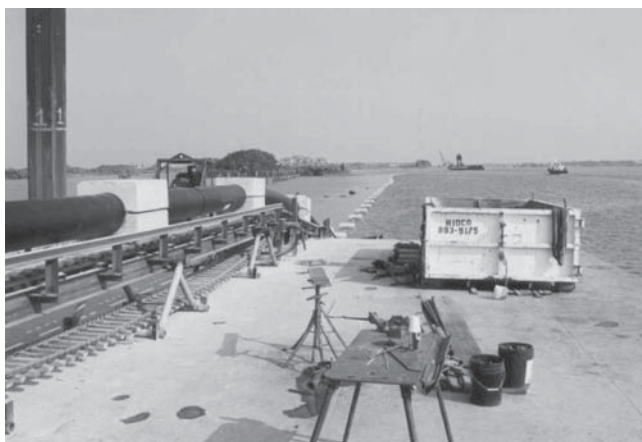
Figure 4 PE Pipe Weighted and Floated for Marine Installation