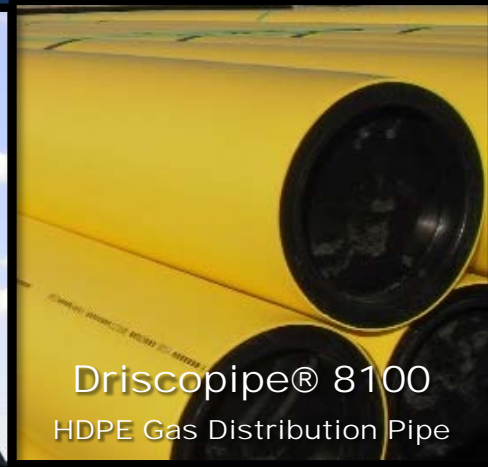
Driscopipe® 8100 HDPE Gas Distribution Pipe