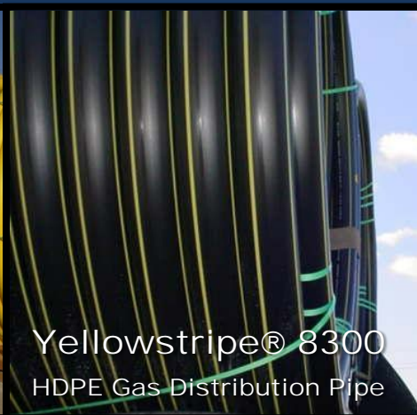
Yellowstripe® 8300 HDPE Gas Distribution Pipe