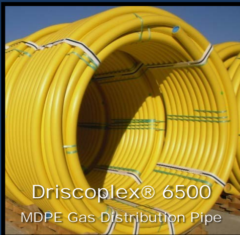
Driscoplex® 6500 MDPE Gas Distribution Pipe