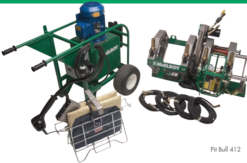
Pit Bull 412

Fusion Capability for 4" IPS to 12" DIPS (110mm - 340mm)