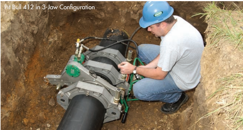
Pit Bull 412 in 3-Jaw Configuration