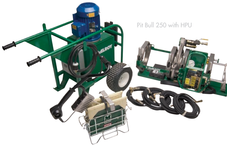
Pit Bull 250 with HPU