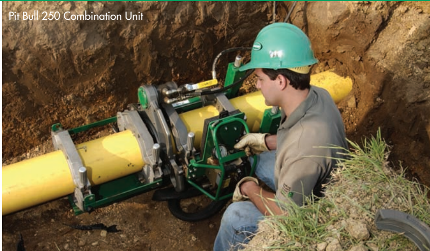
Pit Bull 250 Combination Unit

Fusion Capability for 63mm to 250mm (2" IPS to 8" DIPS)