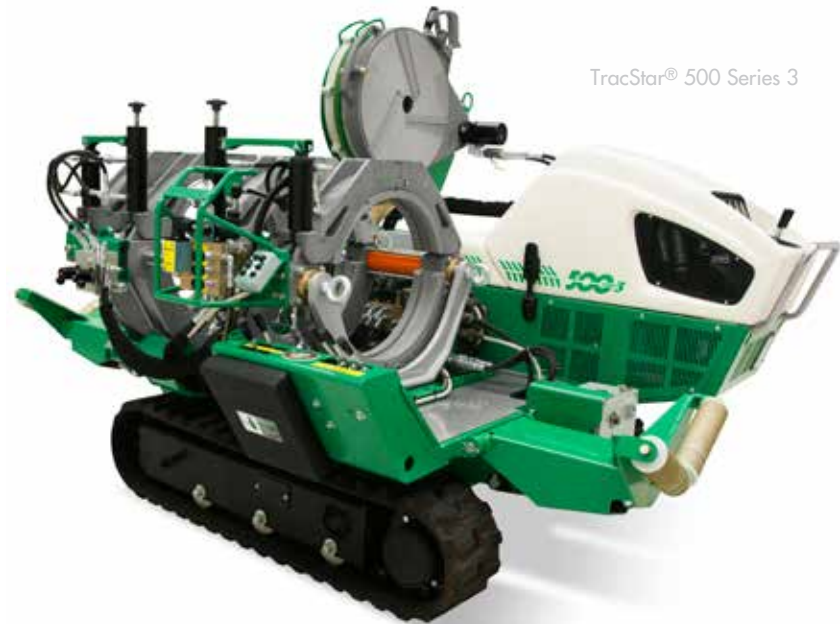
TracStar® 500 Series 3

Fusion Capability for 6" IPS to 20" OD (180mm - 500mm)