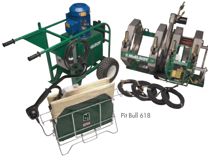
Pit Bull 618

Fusion Capability for 6" IPS to 18" OD (180mm – 450mm)