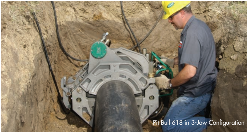
Pit Bull 618 in 3-Jaw Configuration