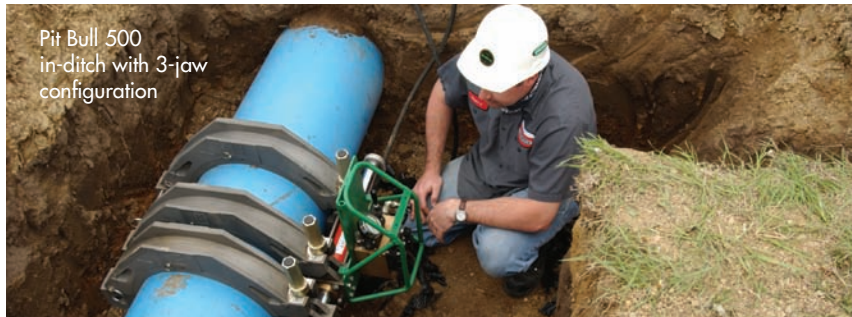
Pit Bull 500 in-ditch with 3-jaw configuration