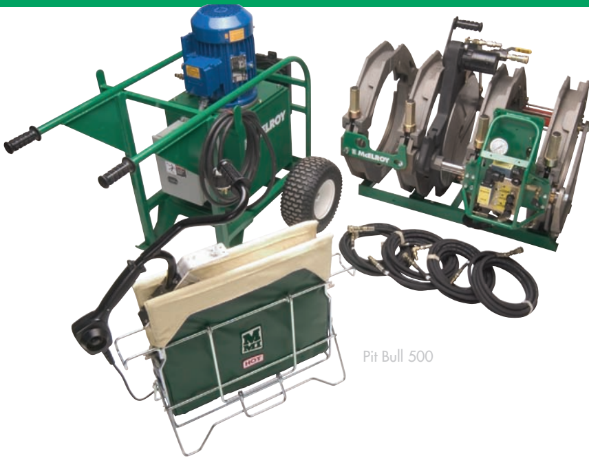
Pit Bull 500

Fusion Capability for 6" IPS to 20" OD (180mm - 500mm)