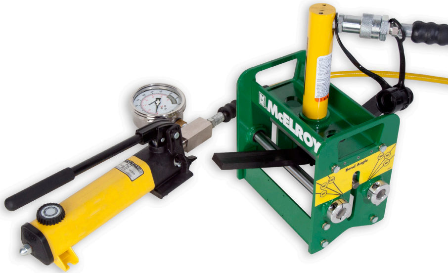
Guided Side Bend Tester Package

Ductility Testing for 1" through 7" pipe walls