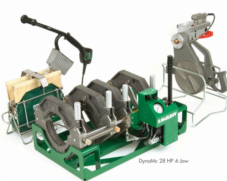
DynaMc 28 HP 4-Jaw

Fusion Capability for 2" IPS to 8" DIPS (63mm - 225mm)